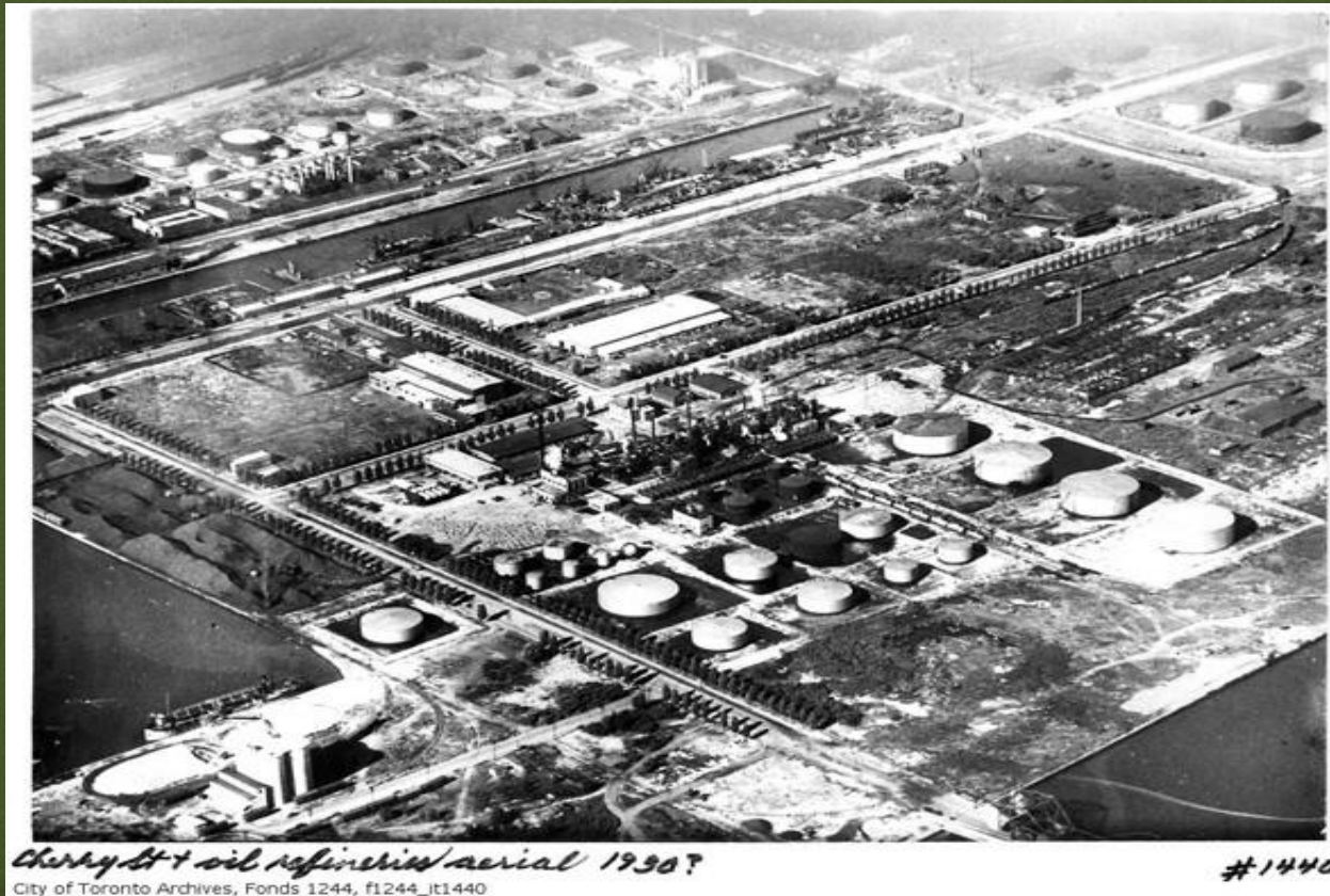
Cherry St. oil refinery aerial 1930? City of Toronto Archives, Fonds 1244, f1244_jt1440